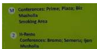
Figure 6 Musholla

For instance, the word 'Musholla' in figure 6 found in the Identification Signage, represents a place of worship specifically designated for Muslims. While some hotels may provide a prayer room or Musholla for the convenience of their staff or guests, it is not a mandatory component of a hotel. Its presence or absence does not define the essential features or identity of a hotel. Based on the analysis of the lexical field and considering the research findings, the word 'Musholla' is not directly associated with the core functions or main components of a hotel. It is a term that is specific to the religious context and has a lower level of meaning when associated with a hotel.