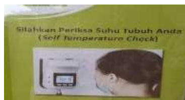
Figure 9 Long Expression 1

According to Kearns (2000), lexical meaning refers to the inherent meaning carried by a word itself, independent of its context. It delves into the core essence and semantic content of individual words. On the other hand, Pateda (2001) emphasizes that lexical semantics examines the overall system of meanings embedded in words, considering their interconnections and semantic networks. Verhaar (1983) adds that the lexical meaning of a word should be observed when it stands alone, as its meaning may change when incorporated into a sentence or context. This highlights the importance of understanding a word's meaning within its specific lexical field, taking into account its associations and relationships with other words.