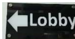
Figure 1 Lobby

According to the data of table 1, certain words are included in the Limited Envelope Register because they represent the names of places or objects that are essential components of a hotel. These words play a central role in defining the identity of the hotel and are commonly used within the general area of the hotel. By considering the lexical field, could be determine these words hold particular significance and are associated with the core functions and features of a hotel. Moreover, by utilizing the concept of the lexical field could be gained insights into the semantic and contextual dimensions of the words found in the signage data. This analysis helps to establish the relationship between these words and the specific domain of hotels, providing a deeper understanding of the linguistic choices and registers employed in hotel signage.