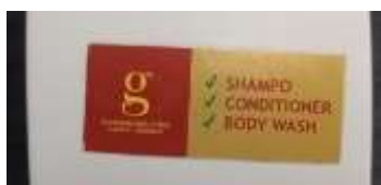
Figure 2 Toiletry Items

The word of 'Lobby' in hotel signage, its usage as a register, reflects its specific function and significance within the hotel industry. The word 'Lobby' is a common and recognized term used in hotels to refer to the area where guests can access various services and facilities. By considering the context of the hotel, the word 'Lobby' takes on a specific meaning and registers as a crucial element of the hotel's identity and operational structure. By analyzing the lexical field and taking into account the contextual factors, it could be accurately to identify and define the registers used in hotel signage, such as the term 'Lobby' which serves as a prominent example of a register specific to the hotel industry.