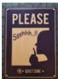
Figure 3. Quiet Zone

By considering the concept of a lexical field, which represents a segment of reality associated with a set of related words, we can understand that 'Quiet Zone' symbolizes the hotel's dedication to offering a tranquil space for guests to rest and unwind (Al-Shemmery & Alshemmery, 2017). The hotel, being a place of accommodation and relaxation, places emphasis on creating an environment conducive to peace and quiet. The 'Quiet Zone' signage serves as a linguistic expression that aligns with the hotel's identity and the expectations of its guests.