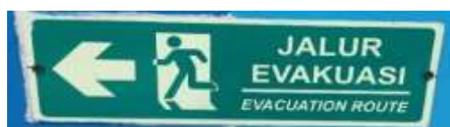
Figure 8 Evacuation Route

The 'Evacuation Route' sign mentioned in Figure 8 serves as an important phrase example of an open envelope register in the context of hotel signage. It indicates the designated path or route that individuals should follow in the event of an emergency or evacuation. The meaning of the word 'Evacuation Route' can be understood by conceptualizing the relationship between the words and the objects or concepts they represent, as discussed in the field of lexical semantics (Pramuniati, 2006). The signage meaning is not limited to the hotel context alone but extends to tall buildings in general, where ensuring safe evacuation procedures is crucial. This additional facility of having a well-defined evacuation route is part of the secured design protocol implemented in hotels and other tall buildings to prioritize the safety and well-being of guests and staff members. By displaying 'Evacuation Route' signage, hotels communicate important information to occupants, guiding them to the nearest emergency exits and ensuring a swift and organized evacuation process if needed. This aligns with established safety standards and protocols for tall buildings, emphasizing the hotel's commitment to maintaining a secure environment for its staff (Obeidat & Abu-melhim, 2017).