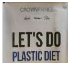
Figure 10 Long Expression 2 Long Expression 2: "Let's do plastic diet "

Another example is in the Table 2.5, the phrase 'Plastic Diet' is included in the Long Expression category of Informational Signage. The term 'Plastic Diet' is a creative play on words, combining the concept of dieting, which typically refers to limiting food and drink consumption for weight loss, with the word 'plastic' to draw attention to the need for reducing plastic usage. It is thought of as the connection between words and objects or objects, according to Pramuniati (2006). The phrase serves as a reminder to guests about the importance of being mindful of their plastic consumption and adopting more sustainable practices in their daily lives.