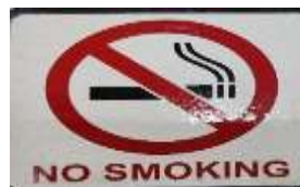
Figure 7 No Smoking

While it may not be considered a main part of the hotel, it is an additional facility or protocol implemented to ensure a fresh and smoke-free environment for the comfort and well-being of all individuals present. The use of 'No Smoking' signage is not exclusive to hotels but is commonly employed in different public spaces such as malls, hospitals, and other buildings where smoking is restricted or prohibited. It aligns with health and safety regulations, aiming to protect non-smokers from the negative effects of second-hand smoke. By designating specific areas where smoking is permitted, hotels might be brought to the needs and preferences of both smokers and non-smokers while maintaining a pleasant and healthy atmosphere within their premises.