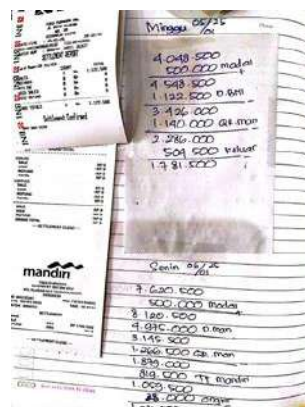
Figure 2. Documentation of Daily Report for MSME Purnama Leather Bags

Figure 2 shows the financial condition of the business before the implementation of simplified financial accounting standards for MSMEs, where the records are still manual. This balance sheet, which shows the total value of assets, liabilities, and owner's equity, also indicates the owner's capital and any commitments or debts that need to be paid. This balance sheet serves as a basis for evaluating changes and the impact of the implementation of these accounting standards on business financial management by showing the financial structure of Purnama Leather Bag MSME before the financial statements are adjusted and presented in accordance with SAK EMKM.