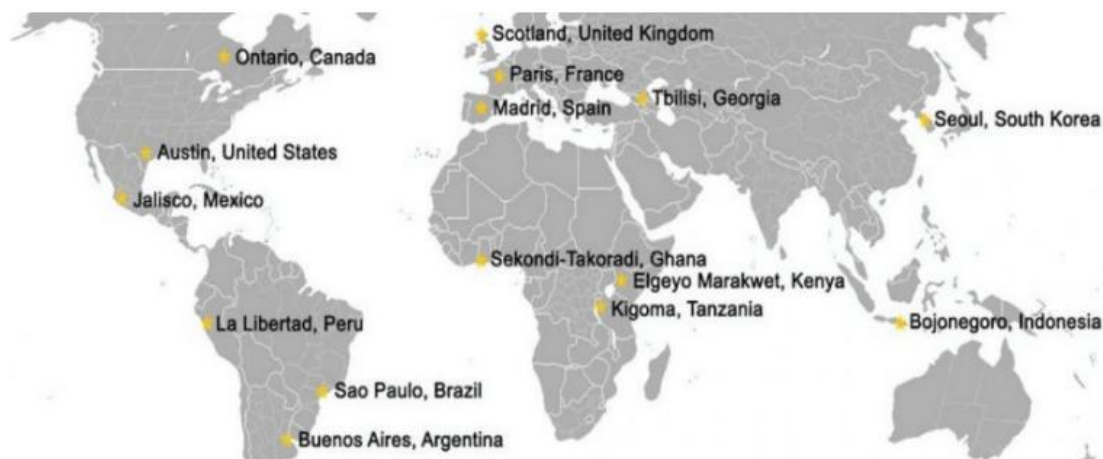
Figure: 1. OGP Regional Government Pilot

Subnational Government Pilot Program of OGP in the selection process followed by 69 Country of 4 Continent, there was America, Africa, Europe, and Asia with more than 40 Local Government as the member. However, only 15 Local Government passed the selection, either Bojonegoro Local Government. More details can be seen in the following picture.