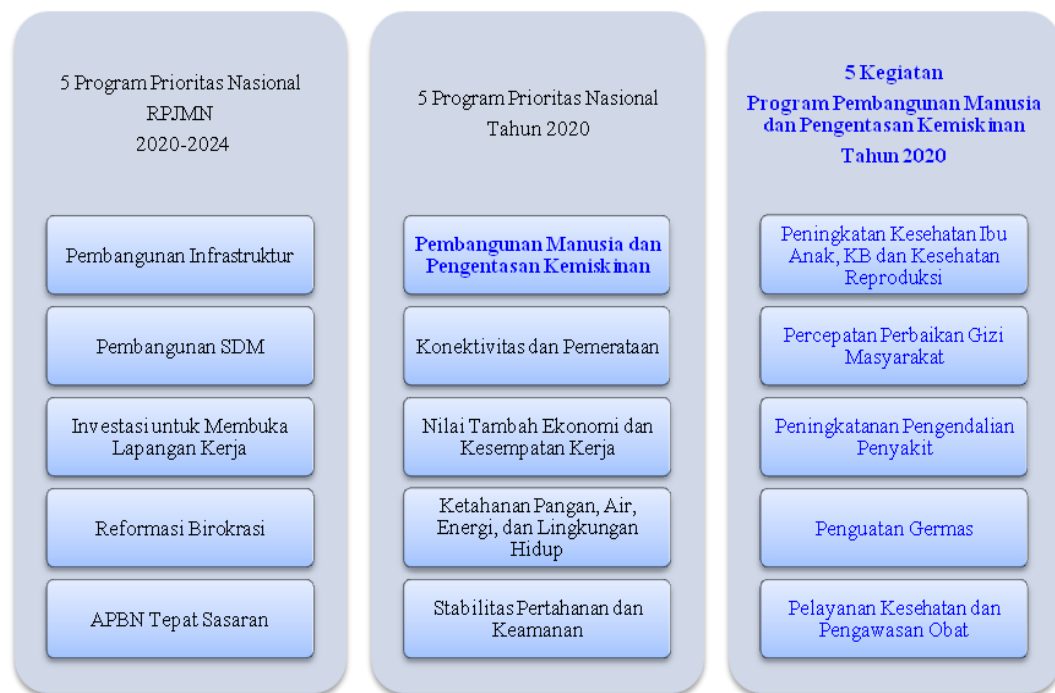
Figure 1. Cascading of National Program

planned activities and programs for 2020 consist of (1) human development and poverty reduction (2) connectivity and equity (3) economic value-added and employment opportunities (4) food, water, energy, and environmental security (5) defense and security stability. In the human development and poverty alleviation program, there are also 5 programs, there are (1) social protection and population management (2) increasing access and quality of health services (3) equitable education services (4) poverty reduction (5) cultural, character, and development nation's achievement. In the program to improve access and quality of health services, there are also 5 activities, there are (1) improving maternal care, child and family planning and health reproduction (2) accelerating improvement of community nutrition (3) improving disease control (4) strengthening community movements (5) improving health services and controlling drugs and food. For better understanding about the government's national cascading program, look at the matrix below: