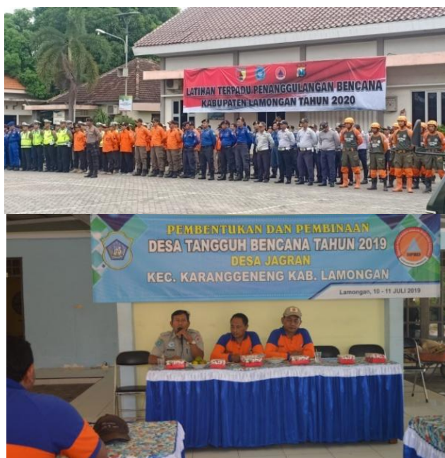
Figure 1. Apel Kesiapsiagaan Bencana and Establishment Destana in Lamongan District

evacuation of affected communities, the Health Office as executor of health services, and others roles. BPBD Lamongan District also conducts basic disaster training for volunteers, village communities, and school children. Apart from training, outreach to increase awareness was also carried out as part of active disaster mitigation.