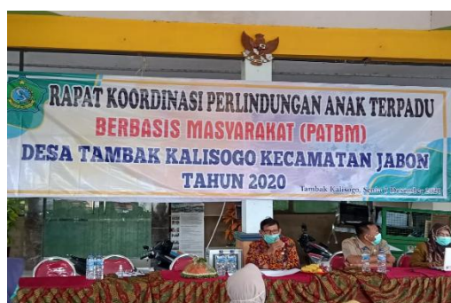
Figure 2 Implementation of Community-Based Integrated Child Protection Coordination Meeting (PATBM) in Kalisogo Village, Jabon Sidoarjo

However, in program implementation, there were still many obstacles, including socialization activities, namely time, in addition, that during the pandemic, there was a PKM policy that regulated attendance at only 25%, and a lot of the budget was cut to be diverted in handling Covid so that the implementation of activities was not optimal. It is hoped that the many activities that have been carried out by the Sidoarjo Regency DP3AKB can increase public awareness of the violence that occurs in the environment, as well as preventive steps or how to report when experiencing violence.