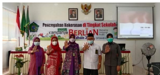
Figure 1 Implementation of the Berlian campaign (Protect Children Together) by DP3AKB Sidoarjo Regency in MTsN 1 Sidoarjo