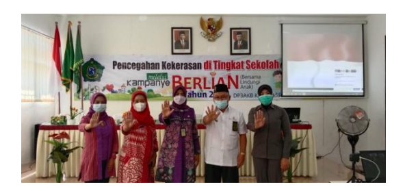
Figure 1 Implementation of the Berlian campaign (Protect Children Together) by DP3AKB Sidoarjo Regency in MTsN 1 Sidoarjo