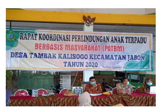
Figure 2 Implementation of Community-Based Integrated Child Protection Coordination Meeting (PATBM) in Kalisogo Village, Jabon Sidoarjo

However, in program implementation, there were still many obstacles, including socialization activities, namely time, in addition, that during the pandemic, there was a PKM policy that regulated attendance at only 25%, and a lot of the budget was cut to be diverted in handling Covid so that the implementation of activities was not optimal. It is hoped that the many activities that have been carried out by the Sidoarjo Regency DP3AKB can increase public awareness of the violence that occurs in the environment, as well as preventive steps or how to report when experiencing violence.