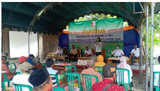
Figure 1: Socialization of the independent farmer program

society (Anggara, 2018). In a study conducted by the author, farmers in Baureno District felt encouraged by the socialization carried out by the government through the independent farmer program.