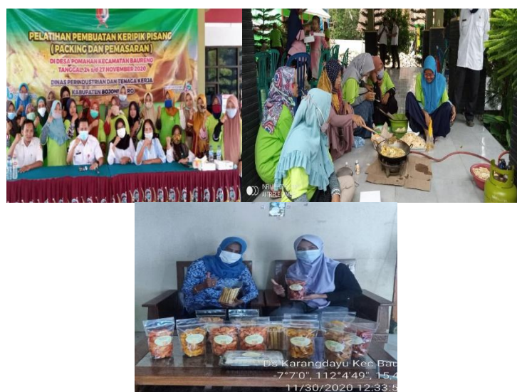
Figure 3: Training in the form of banana chip processing, packaging and marketing of banana chips

Empowerment is an effort to build this power by raising awareness (awareness) of its potential and trying to develop it. The awareness of each individual is influenced by their knowledge (Arditama & Lestari, 2020). In this case, the Bojonegoro Regency government through the independent farmer program provides training as an effort to raise awareness of farmers in Baureno District. Training activities carried out by the Office of Industry and Manpower as representatives of the Bojonegoro Regency Government. The training theme is in accordance with the potential in the community, and the implementation time is in accordance with the training theme. Farmers in Baureno District receive training in the form of banana chip processing, packaging and marketing of banana chips. With this training, it is hoped that it can raise awareness of farmers about the existing potential. And can develop it into a business that can improve the welfare of farmers. So that farmers in Baureno District are increasingly empowered.