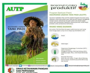
Figure 4: Rice farming insurance

In addition, in raising awareness of farmers, the Bojonegoro Regency government through the independent farmer program provides rice farming insurance (AOTP) to farmers who are members of PPM. Paddy farming insurance is insurance coverage for crop failure caused by pests or natural disasters. Baureno District is one of the districts in Bojonegoro which is prone to flooding. Floods that often hit the agricultural sector resulted in crop failure/puso. With the AOTP, it is hoped that it can raise awareness of farmers in overcoming existing problems. In connection with this, the research conducted by the author, farmers in Baureno District have an awareness of the potential that exists with the training conducted by DISNAKER (Employment State Agency), Bojonegoro Regency, even farmers find it very helpful. With AOTP, farmers in Baureno District feel protected and aware in dealing with existing problems. Even though farmers who have joined AOTP in its implementation have not received insurance because they have not experienced claims/crop failure.