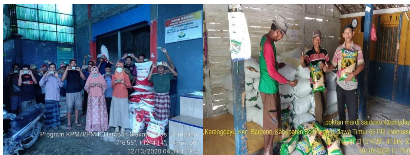
Figure 2: Provision of capital assistance