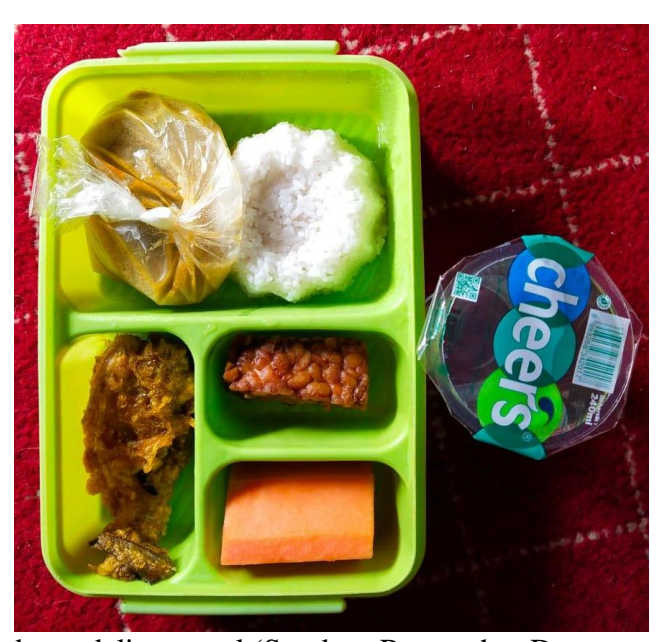
Image 2 Ready-to-deliver meal

vegetables, side dishes (meat/vegetables), and fruit." The food selection for elderly beneficiaries in Rungkut Kidul, which includes rice, vegetables, side dishes, fruit, and mineral water, is reflected in the Feeding Program guidelines. However, there are still inconsistencies in the food packaging. If the catering party runs out of food containers, they are occasionally replaced with styrofoam. This is clearly in violation of the Peraturan Walikota Surabaya Nomor 60 Tahun 2019 on Guidelines for the Implementation of Food Delivery, which specifies that "the meal is packaged in a box that meets health standards."