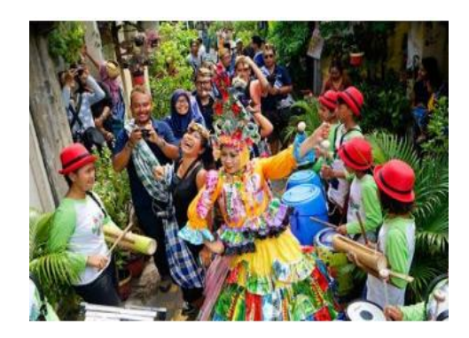
Figure 2 Welcoming Tourists

who are indifferent, this does not interfere with the development activities that have been carried out.