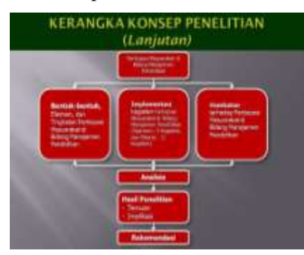
Figure 3.1. The concept of research framework

Improving the quality of education is not just a task manager of the school, but the duty of all components of society. This is understandable because the school is basically just a small part of the education system as a whole. Departing from the above, then the concept of this study can be described as follows: