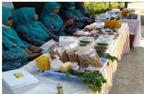
Figure: Eempowerment program activities through PKK

contribution in the form of business consignment. The business consignment system is only a partnership entrusting business from the community to be sold in the BUM Desa sales stand.