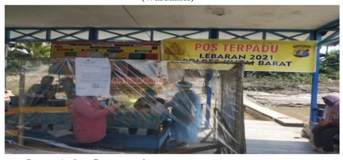
Figure: Health Monitoring and Control Post (Wasdalkes)

The following is a picture of the Health Monitoring and Control Post (Pos Wasdalkes) located on the Mamahak Teboq border in the Mahakam Ulu Regency which was taken by the author during field observations.