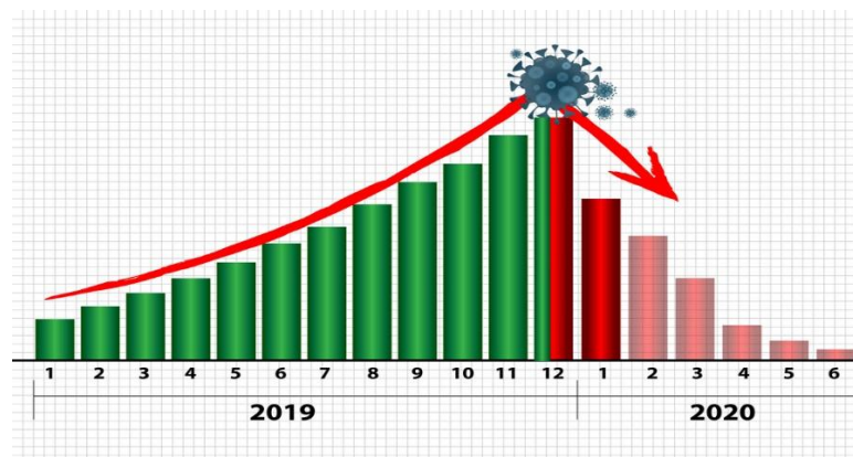
Figure 1: The decline in the market for Micro, Small and Medium Enterprises

The results of Pura and Hasan's research (2016) that the digital marketing revolution is an opportunity that can be utilized by marketers to increase the effectiveness and efficiency of marketing programs by choosing opportunities or being left behind by competitors, as stated by Kotler (2003) "the company constantly adds technology. that gives it a competitive advantage in the market place,". Which is a must "its a Must".