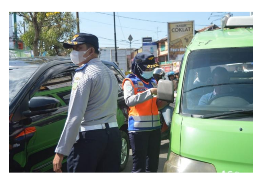
Figure: Joint operation with Police and PM

Based on this, it can be seen that the Transportation Agency has issued a ticket to the owner of a public transportation vehicle in the Joint Operation activity with the Police and PM. This was confirmed by informant 3, who said that the attitude of the Department of Transportation in providing services was indeed good and correct in giving sanctions or ticketing letters when they were late in extending route permits.