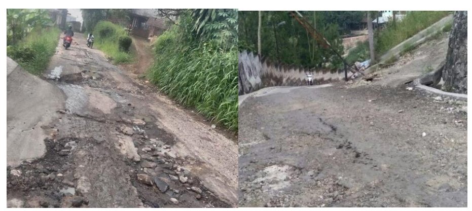
Picture: Road Conditions that are Still Damageed on Jalan Lewi Nanggung, Cicurug District, Sukabumi Regency

two types of damage: severe damage and moderate damage. According to the Directorate General of Highways' road maintenance handbook No. 03/MN/B/1983 Cracks, distortion, surface flaws, wear and tear, obesity, and a loss in past utility plantings are distinct types of road deterioration.