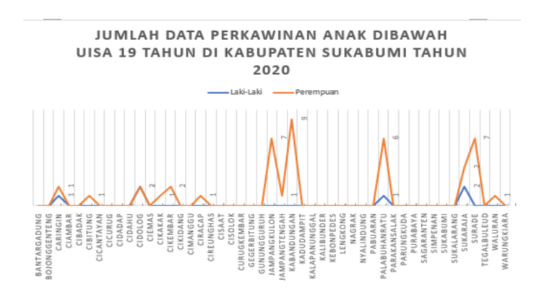
Diagrams 1. 2 Total Data on Child Marriage in Sukabumi Regency in 2020

Based on diagram 1.2 above, it can be interpreted that there were 45 child marriages that occurred in Sukabumi Regency in 2020, with details of 6 boys and 39 girls. Most child marriages occurred in the Kabandungan District with 9 women who were recorded as having married under the age of 19 and then in the Jampang Kulon and Surade sub-districts with 7 women who were registered as having married children. The number of child marriages in 2021 in Sukabumi Regency is shown in the following diagram: