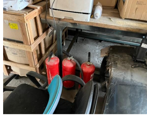
Figure 2. Facilities at BLK for Sewing and Gas Welding Training

BLK are the facilities and infrastructure for persons seeking to obtain skills or enhance their competence in their particular industries. BLK just conduct sewing, culinary, and welding training facilities accessible. However, when the researchers saw the BLK, they discovered that the facility was not properly kept and that many of the amenities were no longer functional. According to the findings, the Sukabumi City Labor Office's role in educating to boost employment in Sukabumi City through skills training programs has been successful but not optimum. The Labor Office's skills training operations take place at the BLK