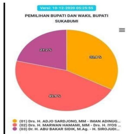
Figure 1.1 Percentage of vote recapitulation results

But at the time of implementation in the field there were still problems due to the occurrence of a high amount of traffic, causing a failure to send the results of the plenary C1. So that the results of voting and vote recapitulation are hampered. Proven in the image below: