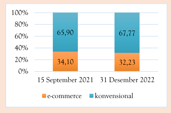
Diagram 1. Percentage of e-commerce and conventional businesses in Indonesia

E-commerce eliminates the problem of distance and time for the parties involved, in carrying out transactions, both sellers and buyers no longer carry out transactions directly, but use internet media thus they do not need to meet physically.<sup>11</sup> This reason allows E-commerce to have an influence not only on a national scale, but also on global trade.<sup>12</sup> E-commerce here includes Tokopedia, Shopee, Lazada, Gojek, and many more. Global research shows that the main reasons on online purchasing are convenience and price. The internet offers the convenience of viewing items, comparing prices, and searching for reviews.<sup>13</sup> The following is data information obtained based on a survey conducted by the Central Statistics Agency.