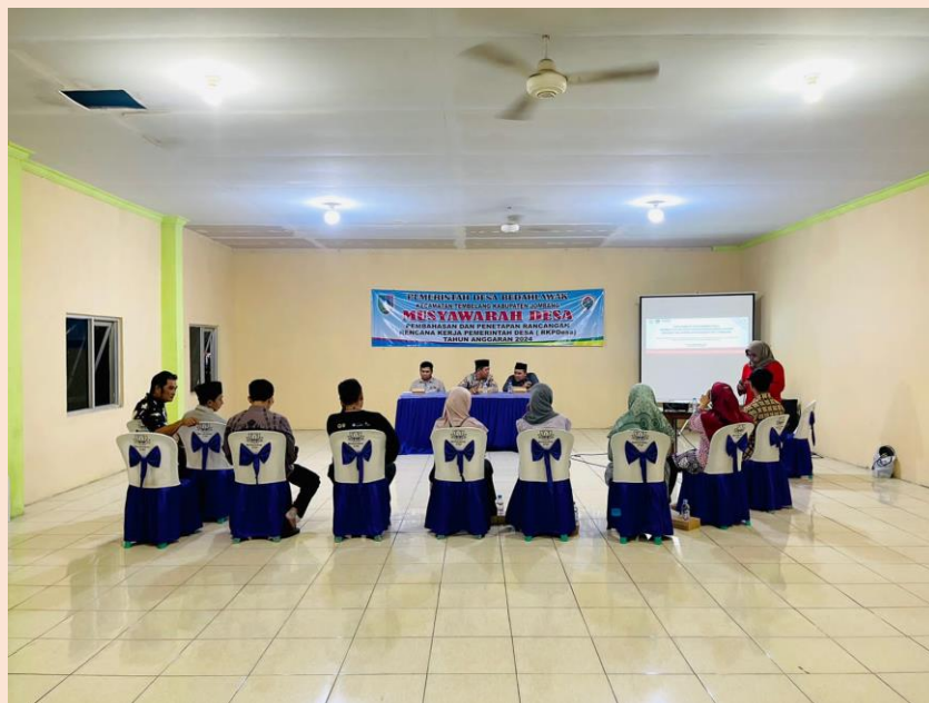
Picture 1. FGD

These six stages are compared with the results of the FGD which was attended by the Village Head, Village Consultative Body, and Community on September 15 th 2023 at the Village Hall of Bedahlawak Village, Jombang Regency, as follows: