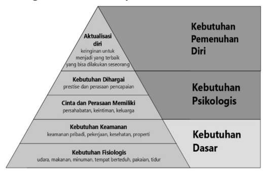
Gambar 1.1 Teori Kebutuhan Maslow

The theory used in this research is Maslow's Hierarchy of Needs. The essence of Maslow's theory is that individual needs are arranged in a hierarchy or level.