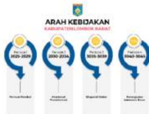
Figure 2: Development Stages of West Lombok Regency in 2025-2045

The West Lombok Regency Government has established a powerful vision for the region-West Lombok Competitiveness, Progress, and Sustainability. This vision serves as a guiding light for the region's future development. The vision that has been formulated is then poured into the formulation of a Framework for carrying out the mission of the West Lombok Regency RPJPD 2025-2045 through 4 (four) stages, with the big theme at each stage of development in line with the stabilization of development contained in the RPJPN 2025-2045. Each of these stages is described in the figure 2: