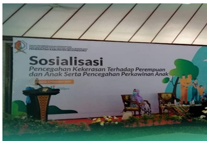
Figure 2. Socialization of child violence prevention by DP3AKB (Source: Secondary data, 2024)

The statement from the head of the women and children empowerment division was validated by evidence of socialization carried out by DP3AKB at the Malowopati Pendopo, Bojonegoro Regency, as shown in Figure 2.