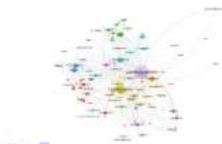
Figure 1. Network visualization

Network visualization (Figure 1) displays topic relationships (Irfan et al., 2023). No duplicate topics are displayed in this visualization. Identical topics that appear in many articles are counted as a single topic (Gaviria-Marin et al., 2019). This visualization represents topics with circles. The size of the circle is determined by its respective weight. The more frequently a topic appears, the larger the resulting circle size. The lines between topics represent links, while the location of each topic indicates the closeness of the relationship (Ham et al., 2019; Lnenicka & Saxena, 2021).