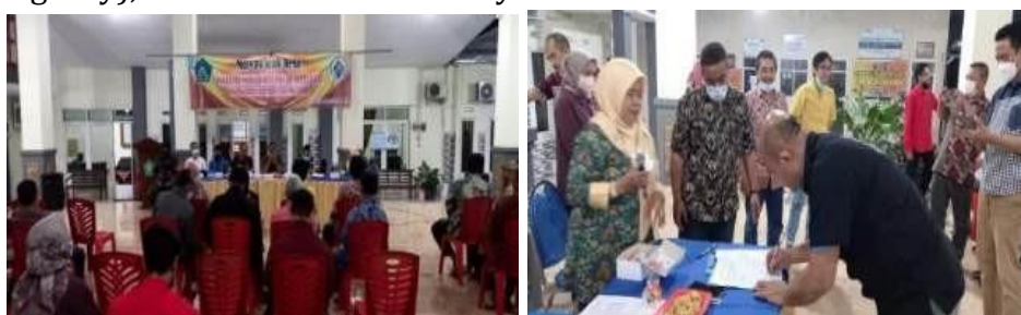
Picture 3. BUMDes Bumiasih Evaluation Activities

The following is a picture of the MUSDES activity or evaluation activities carried out by the Tropodo Village Government with the management of BUMDes, BPD (Village Supervisory Agency), and the local community: