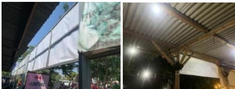
Picture 7. Results of Improvement of Facilities and Infrastructure of BUMDes Bumiasih