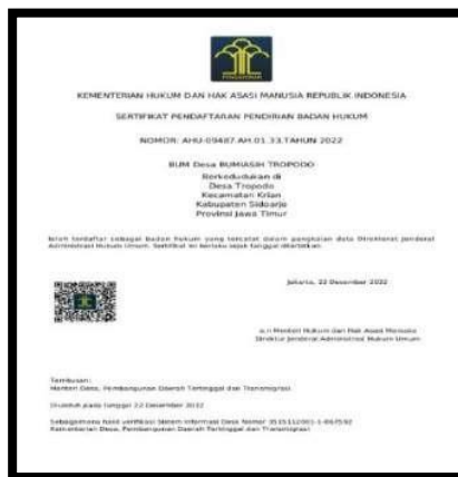
Picture 4. Certificate of Establishment of BUMDes Bumiasih

At the inception of BUMDes Bumiasih, the Director of BUMDes Management took a significant step by proposing the establishment of BUMDes to the Ministry of Villages, Development of Disadvantaged Regions, and Transmigration (KEMENDES). This strategic move was aimed at expanding the capital sources to maximize the development of BUMDes Bumiasih. The support and recognition from the Ministry of Villages, as evidenced by the certificate, is a testament to their crucial role in the growth of BUMDes Bumiasih :