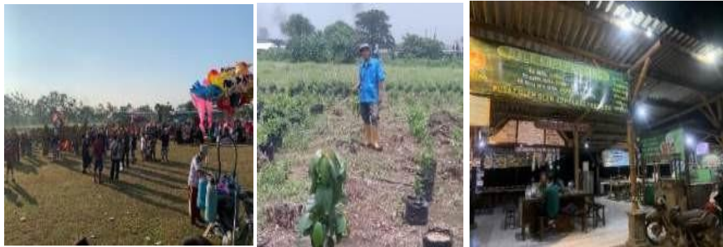
Picture 6. Business Units of BUMDes Bumiasih Tropodo Village

Facilities and infrastructure are important elements in the development of an organization to facilitate its operations. Facilities are used directly, while infrastructure functions as a supporting tool to achieve goals. BUMDes Bumiasih business units are facilities and infrastructure that play an important role in the development of BUMDes, where with the new management is able to make these business units develop significantly. As a maintenance effort, the management of BUMDes Bumiasih routinely controls and receives all forms of complaints related to business unit infrastructure buildings and facilities. The following is a picture of the business units of BUMDes Bumiasih: