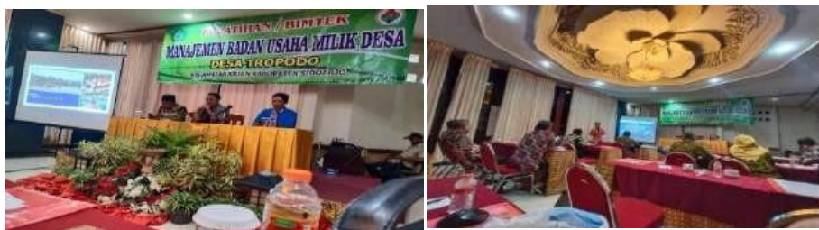
Picture 2. BIMTEK (Technical Guidance) Activities in Trawas

The following is a picture of the BIMTEK (Technical Guidance) activity carried out by the Tropodo Village Government: