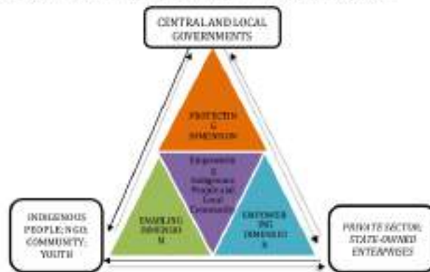
Figure 2. Model of Empowerment Mainstreaming Trilogy for Indigenous People and Local Community

The Model of Empowerment Mainstreaming Trilogy can be adapted through intervention and strengthening the empowerment of indigenous peoples and local communities in Papua. Of course, this is intended to encourage the tourism sector's performance. In general, the pillars of development that are oriented towards community empowerment can be mapped through three pillars (helix): government helix, private helix, and community helix, which simultaneously have roles,