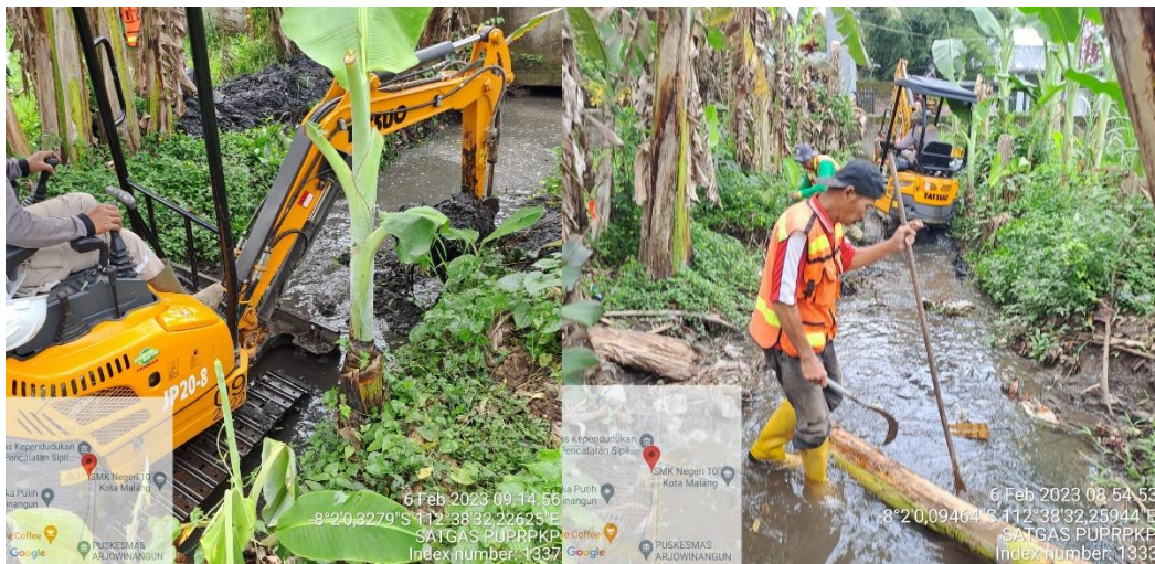
Figure 3. Normalization at Puri Cempaka Putih

Meanwhile, the BPBD of Malang City is still not ideal and inadequate because the facilities here can be suitable if an Early Flood Warning System is installed in every flood-prone area in Malang City. The following is a picture of the Flood Early Warning System (EWS) belonging to the BPBD of Malang City.