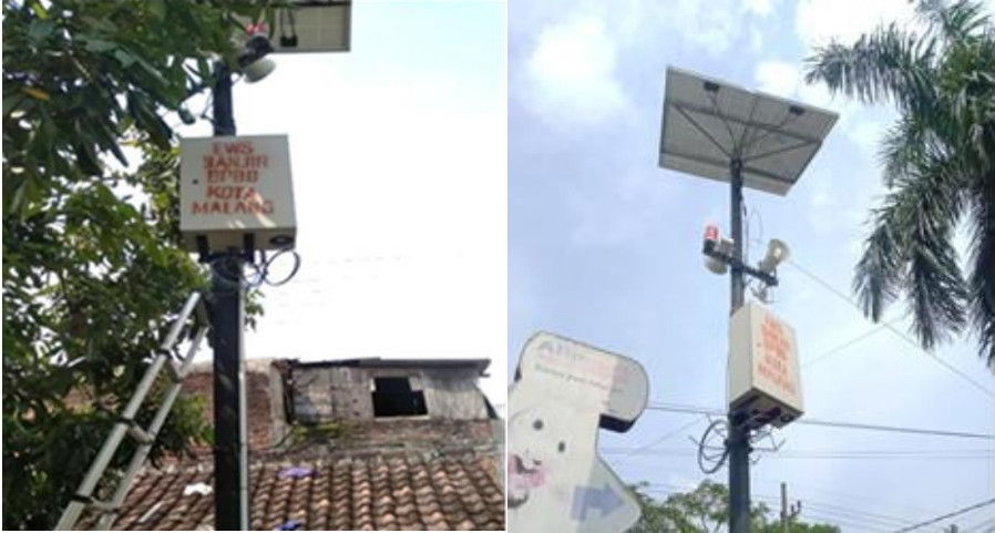
Figure 4. Flood EWS

Meanwhile, the BPBD of Malang City is still not ideal and inadequate because the facilities here can be suitable if an Early Flood Warning System is installed in every flood-prone area in Malang City. The following is a picture of the Flood Early Warning System (EWS) belonging to the BPBD of Malang City.