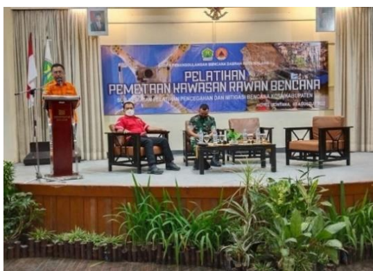
Figure 2. Training on Mapping Disaster Prone Area

Overall, the number of employees at the PUPRPKP Service of Malang City is 286 people, consisting of 130 Civil Servants, 156 Civil Servants, and 12 PUPR Task Forces among them. Meanwhile, human resources at the BPBD of Malang City are sufficient, with 57 personnel consisting of 18 Civil Servants and 39 non- Civil Servants. The BPBD of Malang City also conducts training and outreach to its human resources to improve the quality of its human resources. These improvement efforts can be seen such as in Figure 2 :