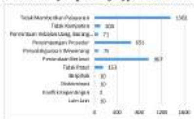
Diagram 2. Number of Community Reports by Type of Maladministration in 2023

Based on the data presented in diagram 1, there is an increase in the number of cases handled by the Ombudsman RI from 2014 to 2023. In 2023, the central Ombudsman and representative offices deal with 26,416 cases, and 3,415 were reports on alleged maladministration. Public reports are submitted in various ways, including by mail, directly to the office, through the PVL OTS program, WhatsApp, email, and others. Based on the type of maladministration that occurred, public reports to Ombudsman RI in 2023 are divided into several types, as shown in diagram 2 below :