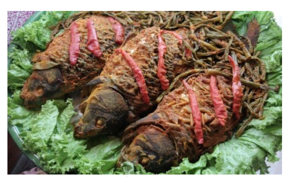
Dekke si mudur-udur

The fishes swim together to the same direction all the times, so the couple are hoped to support each other along their lives.