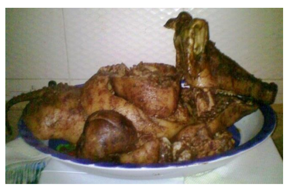
Cultural Food 'Tudu-tudu ni Sipanganon'

The 'food culture' called (tudu-tudu ni sipanganon) is prepared by the groom's side.